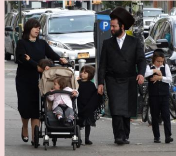
Hasidic Jewish family