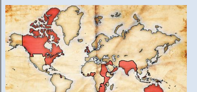
Colonies of the British Empire