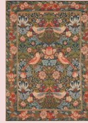
Burne Jones -tapestry