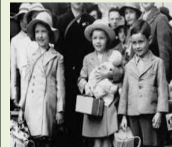
Mass evacuation of children