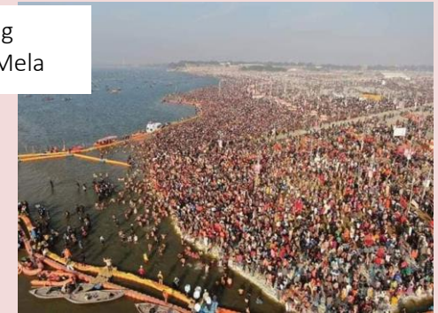
Prayag Kumbh Mela