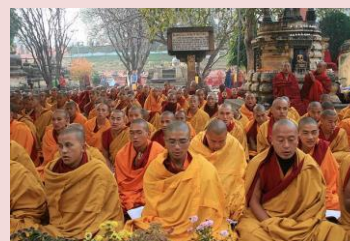
Buddhist monks praying