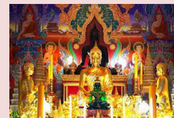
Inside a Buddhist temple