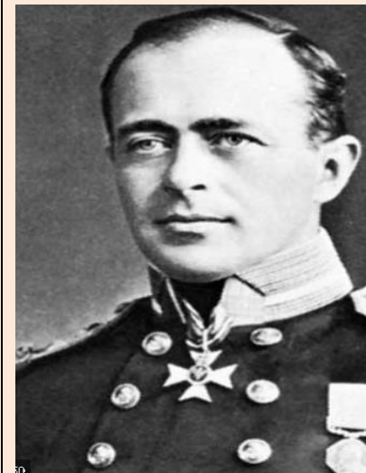
Robert Falcon Scott