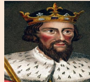
Alfred the Great