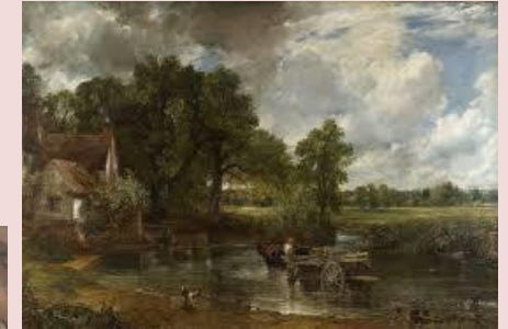
Example of landscape painting – John Constable