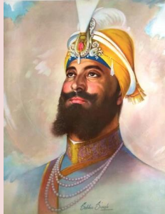
Guru Gobind Singh