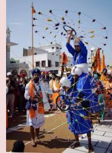
Hola Mohalla celebrations