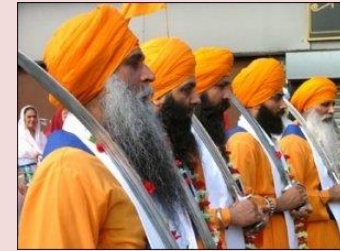
A column of Sikhs