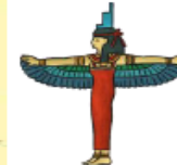
Isis Mother Goddess, Goddess of Protection and Healing