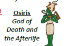
Osiris God of Death and the Afterlife