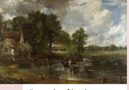
Example of landscape painting – John Constable