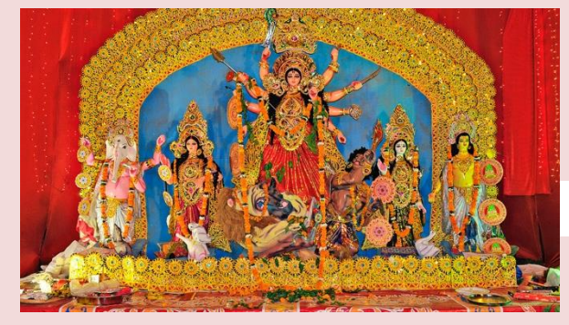
Puja in a Mandir