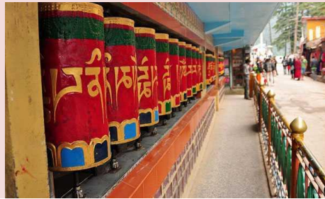
Dalai Lama temple Dharamshala