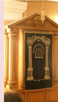
Ark of the Covenant