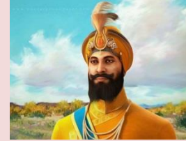
Guru Gobind Singh