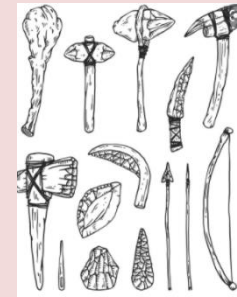
line drawings of Stone Age weapons