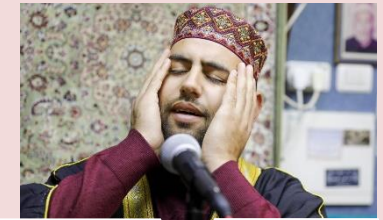
Call to prayer