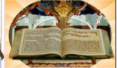
Guru Granth Sahib