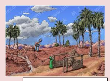
The Wise and the Foolish Builders