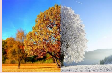
Trees in Autumn and Winter