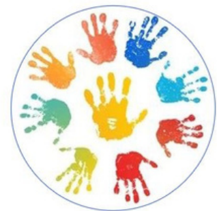
Years 1 and 2 @Years1and2BPPS