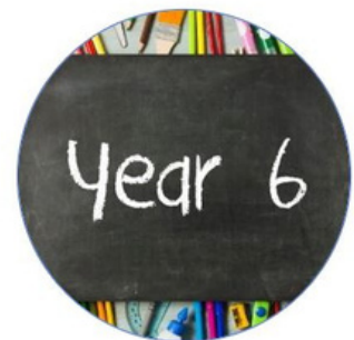
Year 6 @Year6BPPS