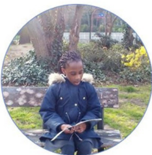
Year 3 @Year3BPPS