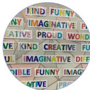
Years 4 and 5 @Years4and5BPPS