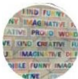
Year 5 @Year5BPPS