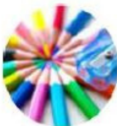
Year 2 @Year2BPPS