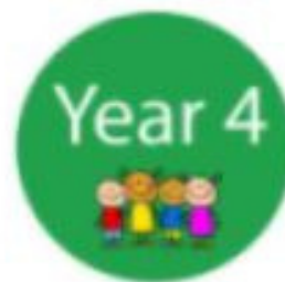
Year 4 @Year4BPPS