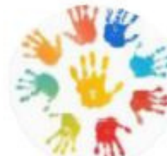
Year 1 @Year1BPPS