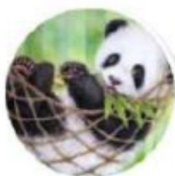
Year 3 @Year3BPPS