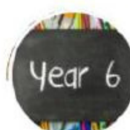
Year 6 @Year6BPPS