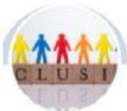
Inclusion Team @InclusionBPPS