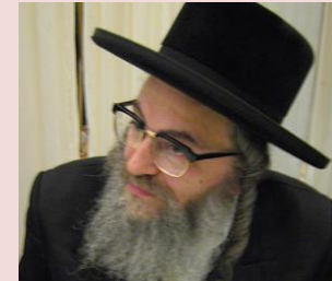
Side curls and Hoiche Hat