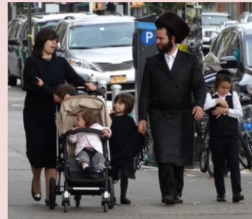
Hasidic Jewish family