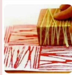
printing with string design on a card base