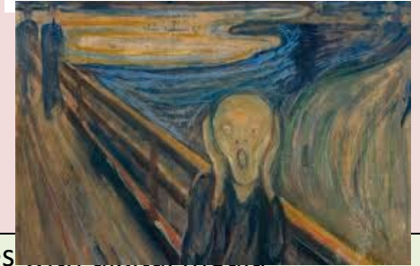
Scream by Edvard Munch